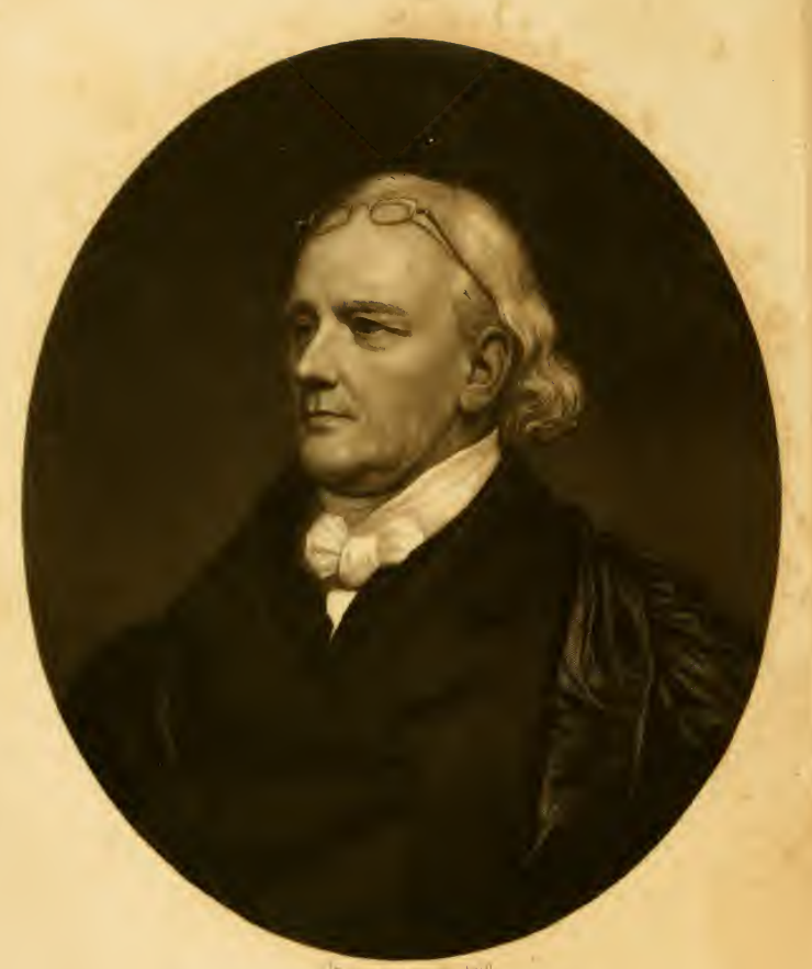
de very son Eartain